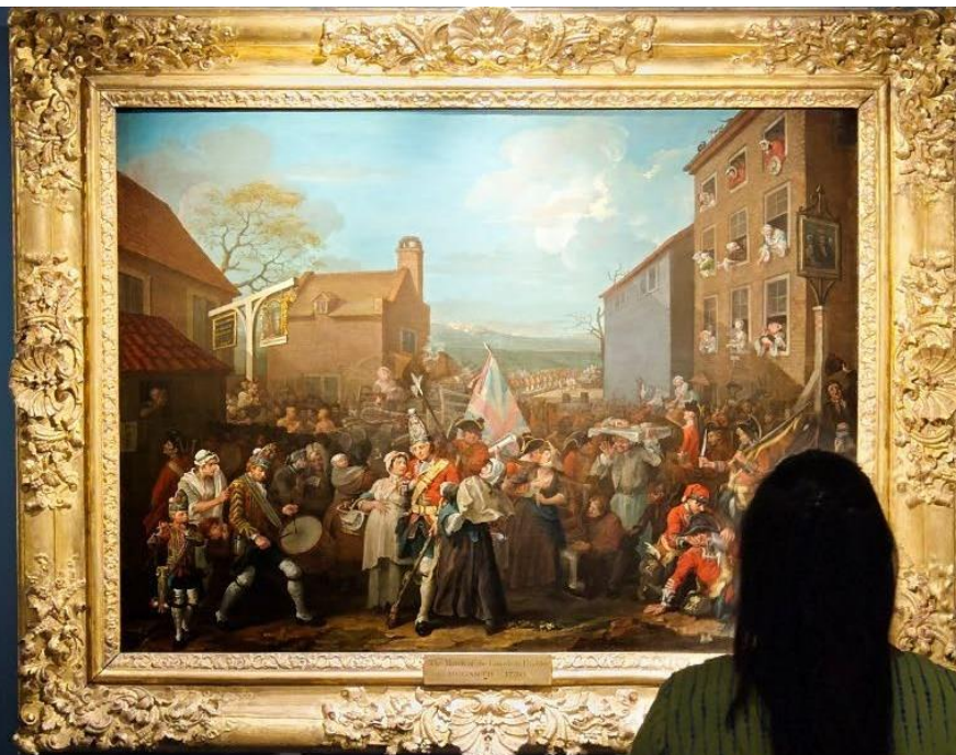
Visitor in front of William Hogarth's March of the Guards to Finchley, 1750 , listening to a historically accurate 3D soundscape, created by Martyn Ware for the exhibition Hogarth & The Art of Noise

You can find out more about our Collections here . To find out more about our Exhibitions and Displays please visit our website .