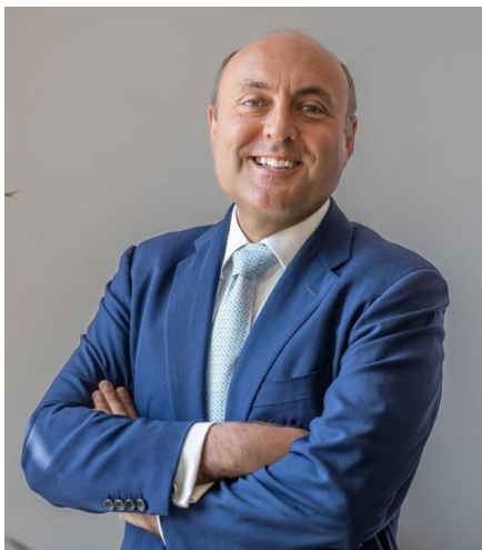
Andrew Griffith MP

We encourage applications from outstanding leaders from a diverse range of sectors and backgrounds. I trust you will find the information enclosed in this job pack of interest, and we look forward to receiving your application.