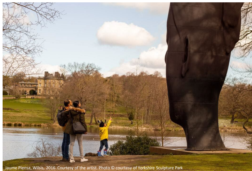
Jaume Plensa, Wilsis, 2016. Courtesy of the artist.

Our largest expenditure is staffing and maintaining the vast heritage estate. Like many cultural institutions, we are sensitive to fluctuations in visitor numbers and public funding, but our balanced and adaptive funding model ensures that YSP remains strong and forward-looking.