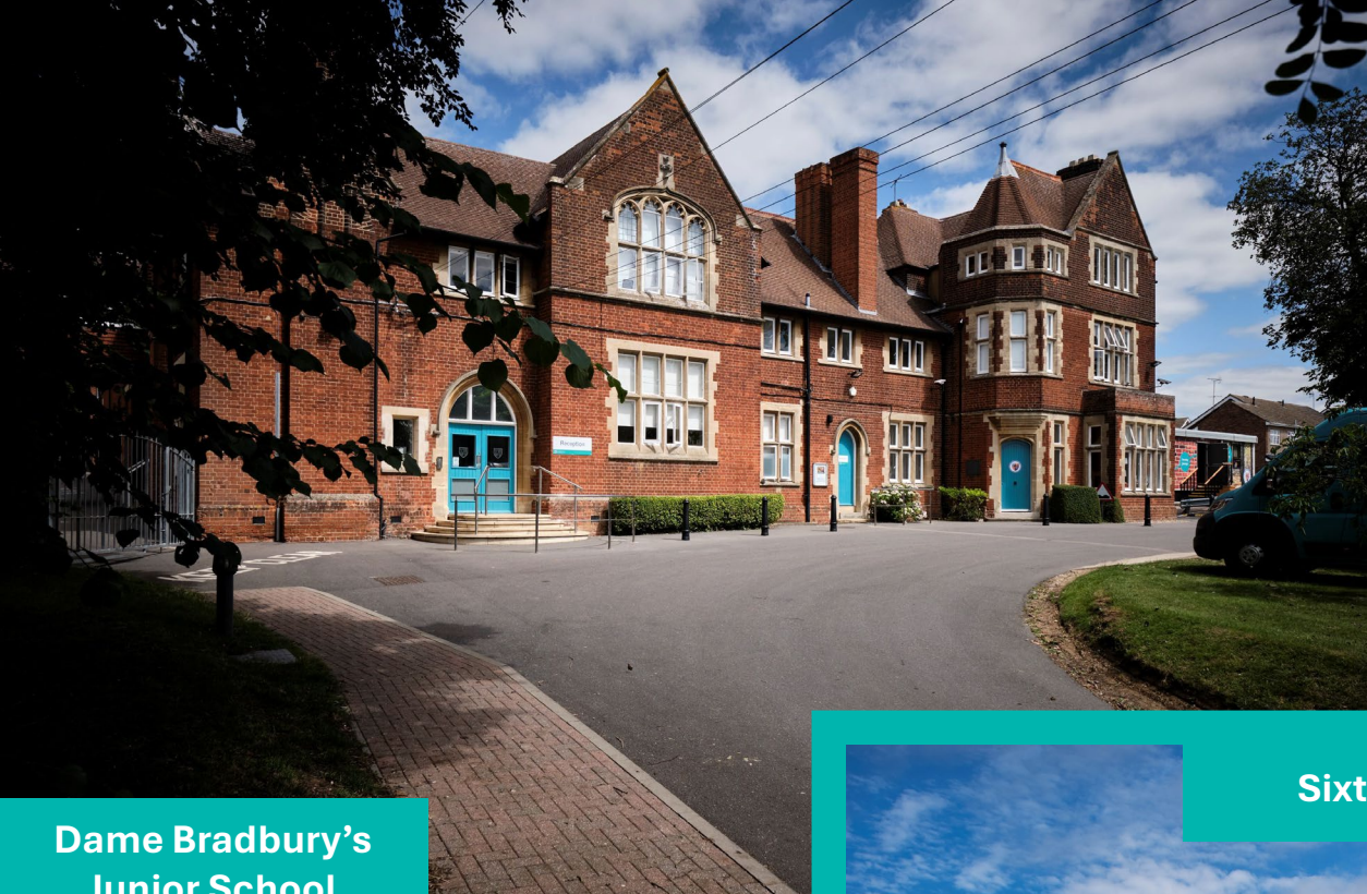
Dame Bradbury's Junior School