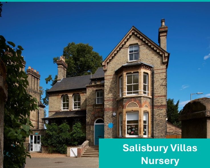
Salisbury Villas Nursery